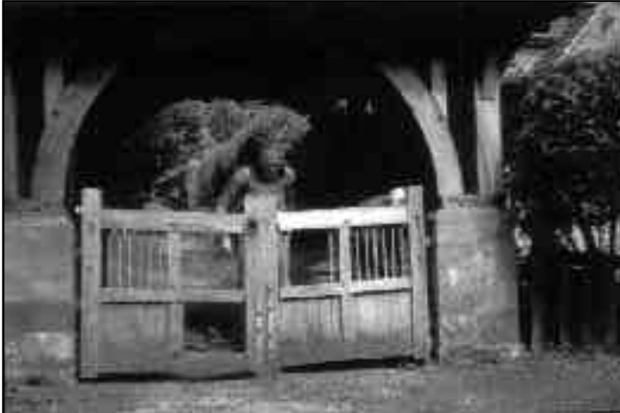
Jim Oakley dismantling the Lych Gates for restoration. April 2001.

In september, two 7" x 7" oak posts were obtained, but during collection, went through the floor of John Barnett's trailer, which had to be rebuilt! The posts were then preservative-treated ready for installation.