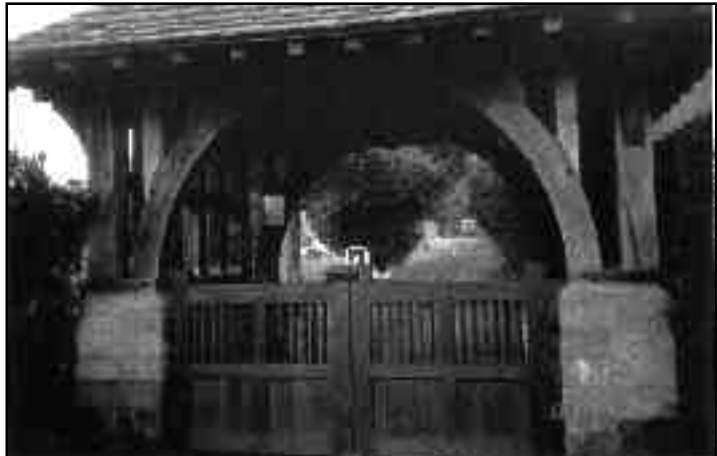
The restored Lych gates, November 2001.

The gates have now been installed some four months, and have been much admired. The parochial church and parish councils are now considering further work both in the cemetery area, and replacing the adjacent bus shelter, which is now considered too old and shabby!